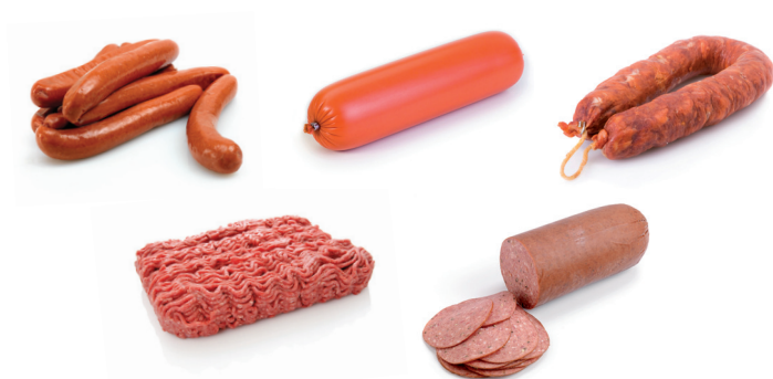
MeatScan™ measures fat in raw meat and meat products.