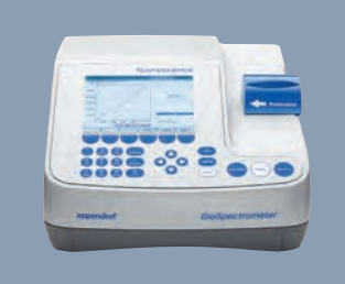
2013 Eppendorf BioSpectrometer® fluorescence