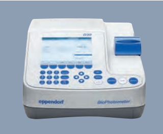
2013 Eppendorf BioPhotometer® D30