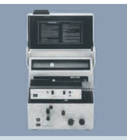
1968 Photometer 1101 and 1102