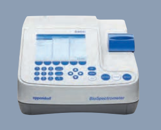
2011 Eppendorf BioSpectrometer® basic/kinetic