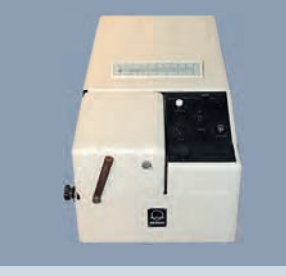
1950 Photometer »Medeor«: Spectrophotometer

Eppendorf has developed an impressive level of expertise through it contributions to the field of photometry. Eppendorf brought its first photometer on the market over 60 years ago. With its current product portfolio, Eppendorf allows you to select the optimal combination of devices and accessories from a large, rapidly expanding, range of products. From fluorescence-based applications to microvolume measurements: anything is possible!